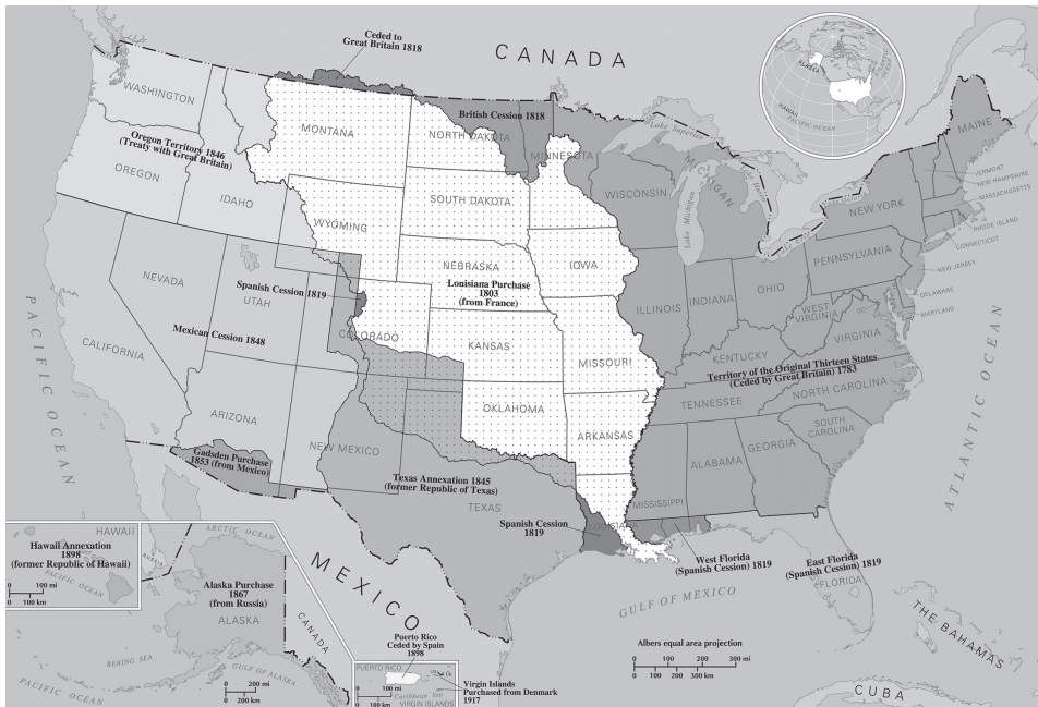
Fig. 1. The westward expansion of the United States showing the area of the Louisiana Purchase of 1803.

Nebraska, Missouri, California, from as far afield as destiny could reach, to pan the stre-ambeds and stake their claims. Municipality inevitably followed, felling the forests and carving up the land into the exacting patterns settlement required. With development came administration, with adjudication came law. And alongside the constitutions self-assembly necessarily enumerated, in the very elections that stratified the unruly crowd into self-governable units – in the tempering of passions that imposed will like a wedge – the great light of Masonry shone, stringing lamps along the placer, up into the shadow of the mountains.