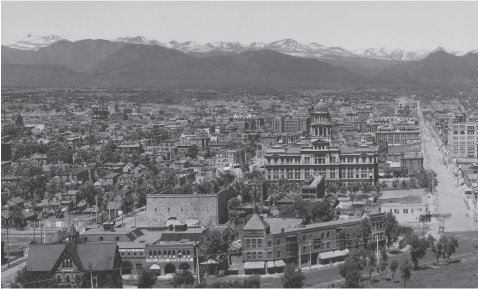
Fig. 7. Denver, 1898.

Resolved, That on account of our distance from, and difficulty of communicating with, the proper authorities, we the people who are the power here, authorize the late county officers-elect to enter at once upon the discharge of their respective duties, without waiting for their commissions from the Governor, after having received their certificates of election from the Commissioners and having given the proper bonds.