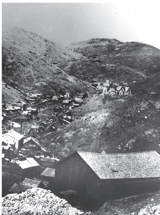
Fig. 4. Central City c.1860.

As the winter months closed in and the multitude returned to the lower elevations, Auraria and Denver City once again swelled. The flux in populations, responding even to the merest hint of the 'colour,' seems to have created an instability in the regularity of Auraria Lodge's proceedings. This population flux, along with the vagaries of navigation over unpredictable streams and clashes with the surrounding tribes on the route to Kansas Territory, may have been an important factor in Auraria Lodge failing to secure its charter until after the establishment of the Grand Lodge of Colorado in 1861.