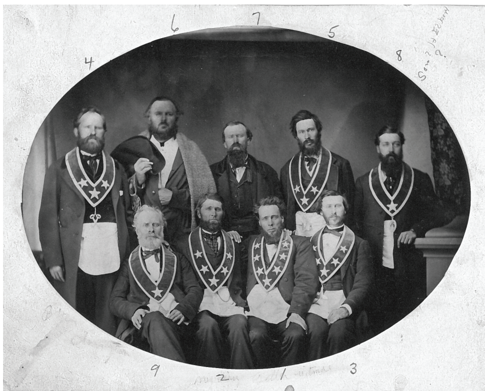
Fig. 6. Officers of the Grand Lodge of Colorado in 1863. Past Grand Master J. M. Chivington is back row, second from the left.

Of the three constituted lodges under the Grand Lodge of Colorado, only Summit No. 2 presented a return. Discussion was had as to the chartering of Nevada Lodge No. 36 by the Grand Lodge of Kansas Territory, deemed an erroneous incursion of the new sovereignty: