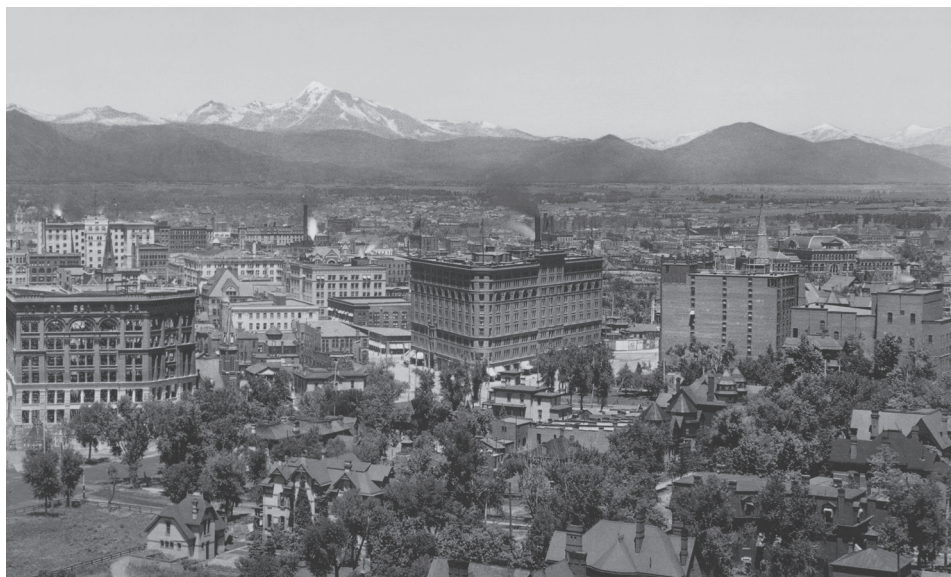
Fig. 8. Denver, 1898.